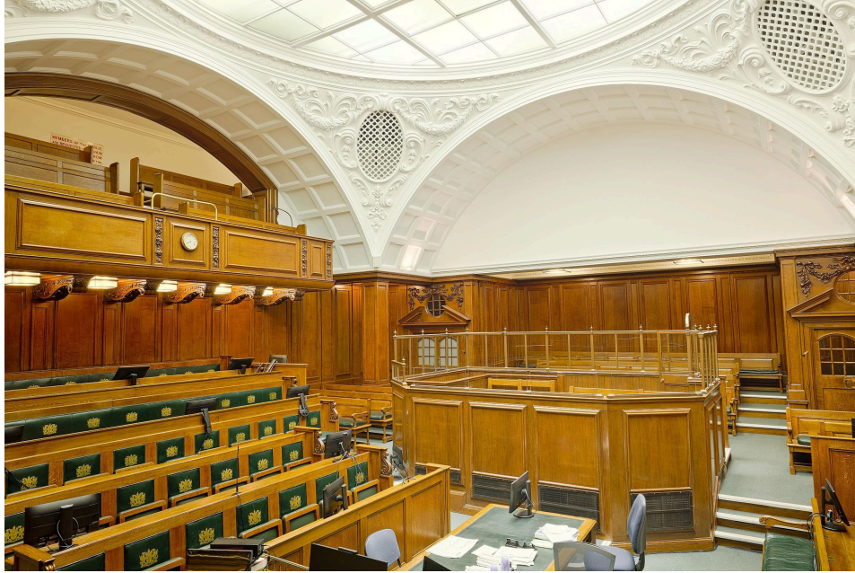
Inside Court One, The Old Bailey, London. (Inner London Crown Court)