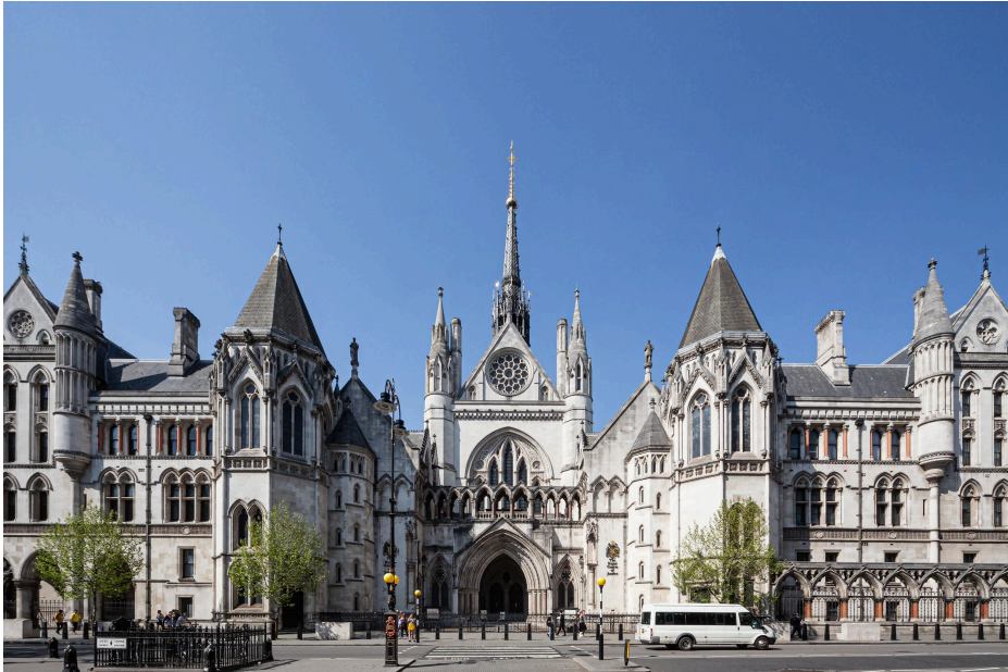
The Royal Courts of Justice, London