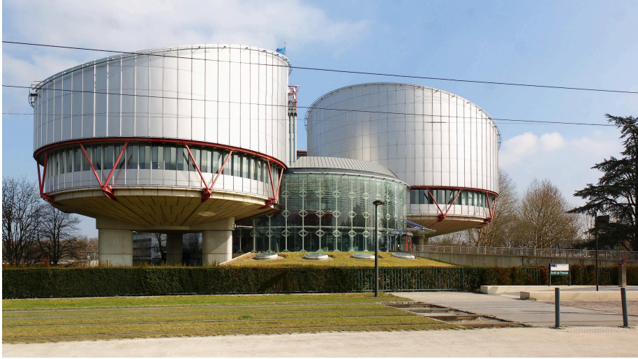
The European Court of Human Rights - Strasberg, France.